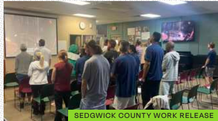
SEDGWICK COUNTY WORK RELEASE