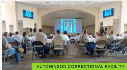
HUTCHINSON CORRECTIONAL FACILITY