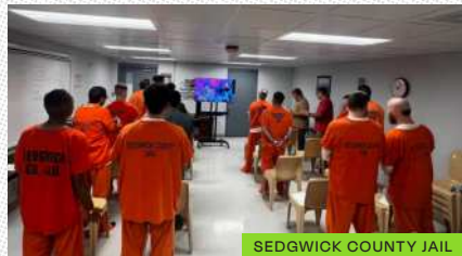
SEDGWICK COUNTY JAIL