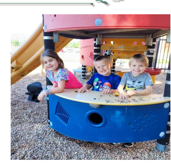
We have SO much fun on our Playground!